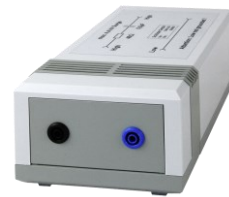
Fig.: CWG 553-MC (front)