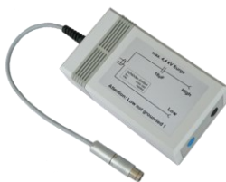
Fig.: CWG 550