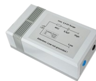
Fig.: CWG 553-MC