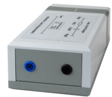
CWG 553-MC (back)