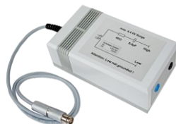
Fig.: CWG 553